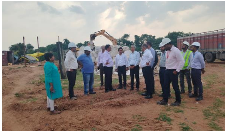
PNGRB team visiting Brahmni river HDD crossing work site