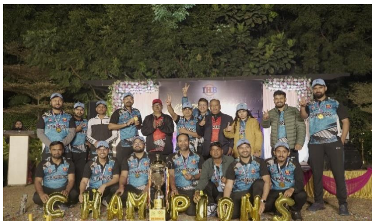
Interstate Sports meet at Gorakhpur, Uttar Pradesh